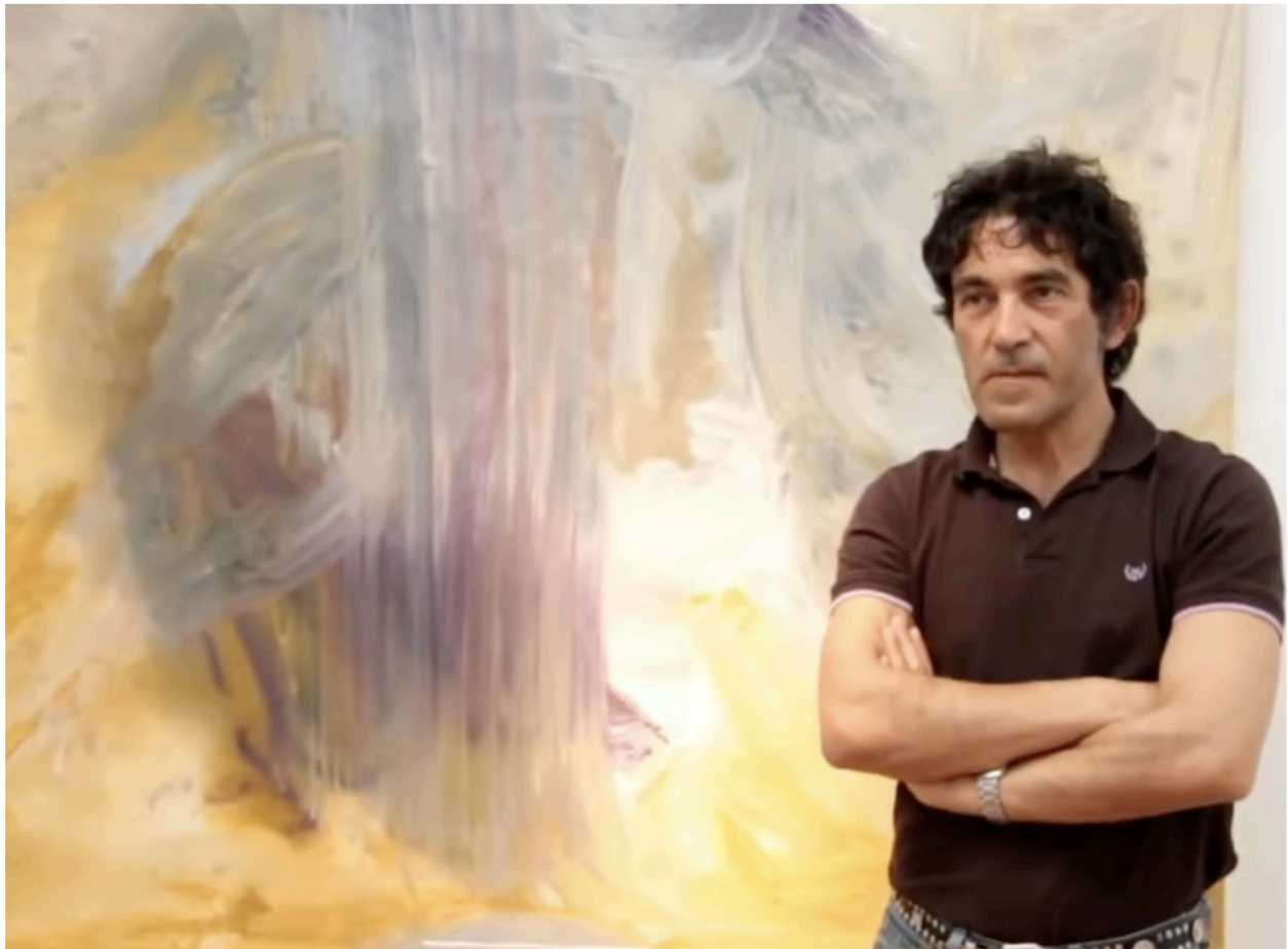
Salvatore Garau auctions an invisible structure (Salvatore Garau/ YouTube)

An Italian artist reportedly sold an “invisible” sculpture for $18,000 (£12,959) at an auction that took place earlier this month.